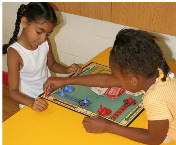
Club members playing a board game - one of the many activities available at BGCFC.

Volunteers may lead programs on specific topics, coach sports teams and referee tournaments, help with meals, assist managers in the office, help to keep the club spotless, and become role models to the youth they help serve. Volunteers may download an application online at www.BGCFC.org . After completing a background check and short orientation to the club, volunteers are acclimated to the club environment and are given additional responsibilities as they become comfortable with their roles in helping the Boys & Girls Club of Frederick County be the positive place for kids.