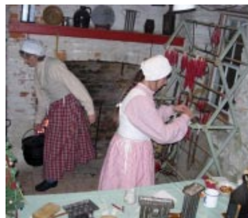
Schifferstadt volunteers assist visitors with a candlemaking activity during the annual Museums by Candlelight open house. The upcoming event will take place on December 8, 2007.

The Schifferstadt Architectural Museum, located at the intersection of RT. 15 and Rosemont Avenue, is a farmhouse built at the beginning of the French and Indian War. It is one of the best examples of German colonial architecture in the country, and tours focus on the interesting details