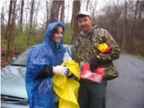
Volunteers from Apple United Church of Christ gather supplies to start their clean-up.