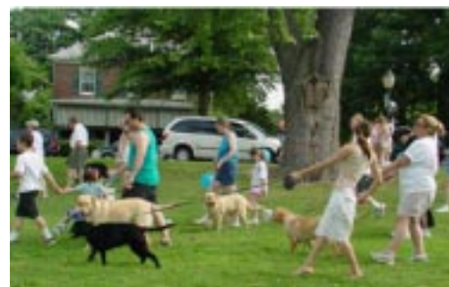
Human Society's 2005 Walk N' Wag